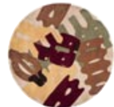
NEW WAVE 104 - IVORY 100% hand-knotted wool 7',9" round - $1075