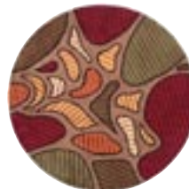
NEW WAVE 102 - TAUPE 100% hand-knotted wool 7',9" round - $1075

For more information contact a sales representative at the Novi 248.449.7847 or Birmingham 248.646.7847 showrooms www.originalhagopian.com